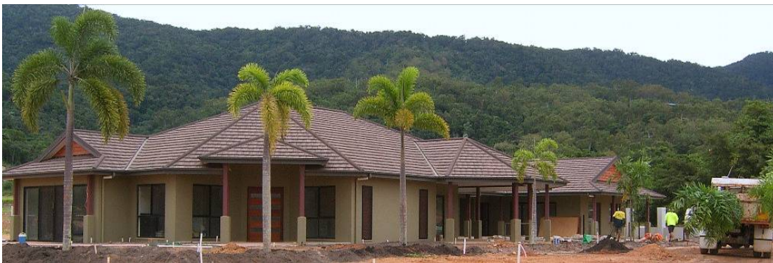
Landscapers at work at the sales office site – May 2006

One unfortunate result of all the wet weather is the unavoidable delay in construction. Only last week, the road crew were smiling and patting themselves on the back for being able to get on site and make a huge difference in a short time, then the rains visited us again. Even the landscapers are ready for some dry weather. If you want to see our landscapers' work, keep checking out the sales office. It no longer looks quite so lonely with a few trees and greenery around it! It was an amazing transformation in just a few days.